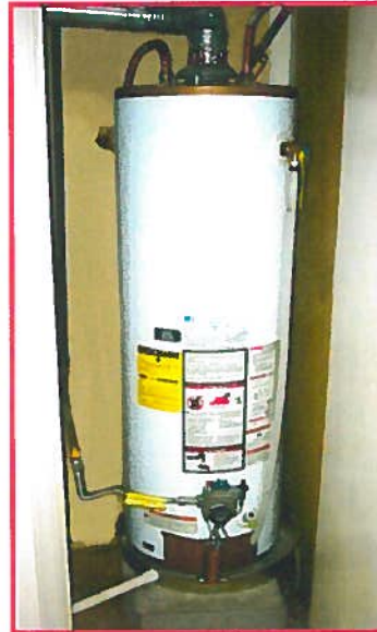
See Page 2 for part information

*For multiple heaters, use the total volume of the heaters plus any storage tanks.