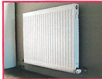
See Page 4 for part information